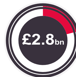
UK VAT CONTRIBUTION TO EU