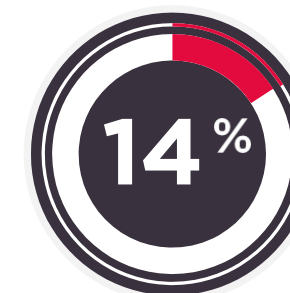
EU VAT GAP