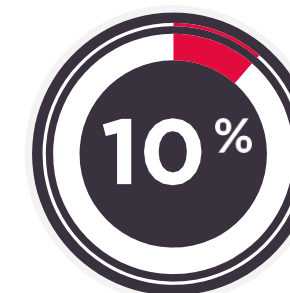
UK VAT GAP