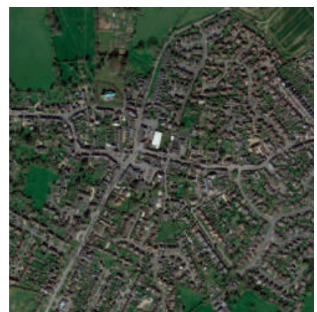
Aerial view of Long Buckby

“At the Triple 1 Group we practice fair treatment and opportunity so that all our employees feel supported...”